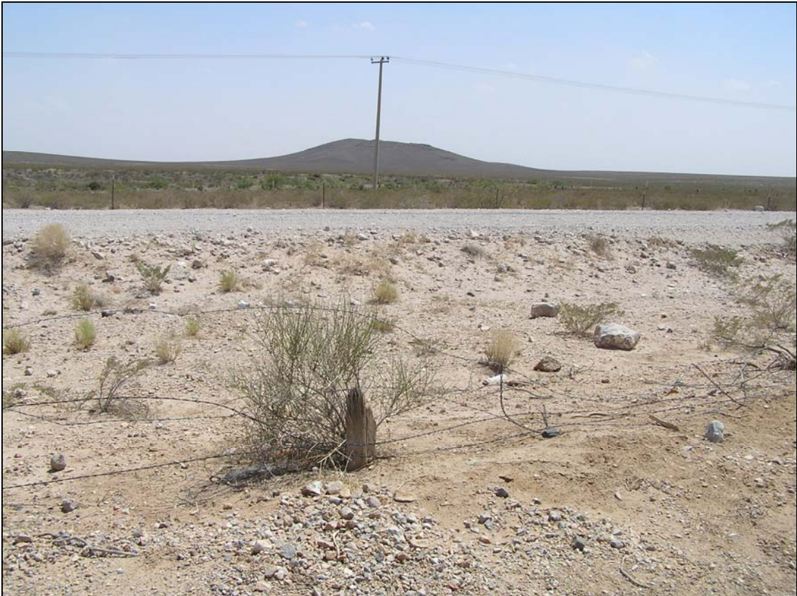
U.S.-Mexico border in New Mexico

The United States border with Mexico extends nearly 2,000 miles along the southern borders of California, Arizona, New Mexico and Texas. In most areas, the border is located in remote and sparsely populated areas of vast desert and rugged mountain terrain.