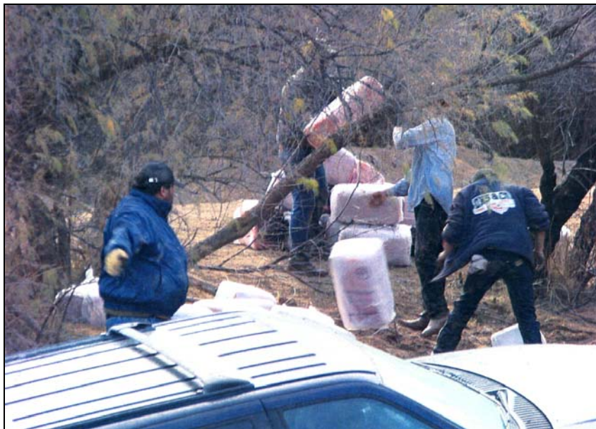
Cartel members unloading drugs after failed attempt at U.S. entry during alleged military incursion January 23, 2006

On January 25, 2006, the Ambassador sent a Diplomatic Note to the Mexican Government regarding the January 23, 2006 border incursion in Hudspeth County, Texas. Ambassador Garza requested the Mexican government fully investigate the January 23 incident in which individuals dressed in military uniforms, carrying military-style weapons, and using military vehicles intervened to prevent a drug shipment from being intercepted by U.S. law enforcement operating in the United States. 71